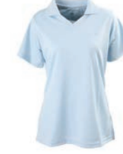
ENT100I-2830 Women's Cut Polo