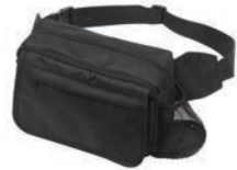
EH500I-21156 Waist Bag