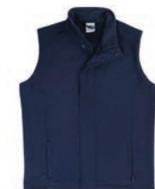
ENT300I-7878 Men's Cut Soft Shell Vest