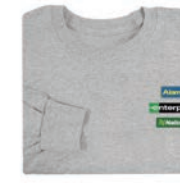
EH1700I-1002 Tribrand L/S T-Shirt MultiBrand