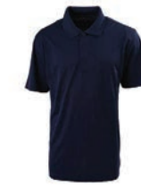
ENT100I-2821 Men's Cut S/S Polo Shirt