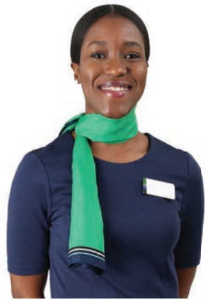
THE SLIP KNOT