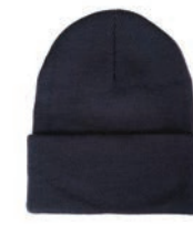
EH900I-21152 Non-branded Knit Cap