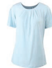
ENT400I-1284 Women's Cut Scoop-Neck Blouse