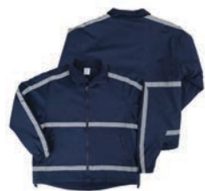
ENT300I-7875 Lt Wt Nylon Jacket