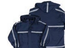
ENT3001-7855 3-in-1 System Parka