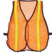
EH800I-21076 Safety Vest no Logo