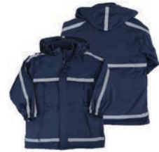
ENT300I-7855 3-in-1 System Parka