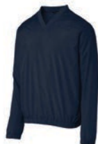
ENT3000I-7874 L/S Windshirt