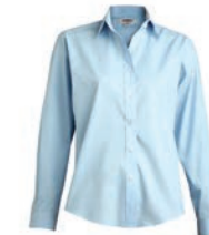
ENT400I-2122 Women's Cut L/S Dress Shirts