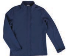
ENT3001-7877 Women's Cut Soft Shell Jacket