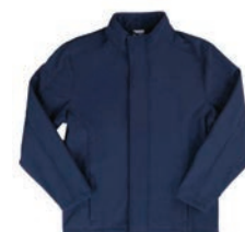
ENT300I-7876 Men's Cut Soft Shell Jacket