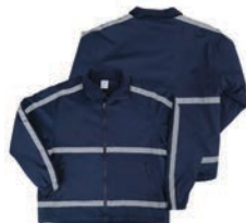
ENT3001-7875 Lt Wt Nylon Jacket