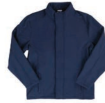
ENT300I-7876 Men's Cut Soft Shell Jacket