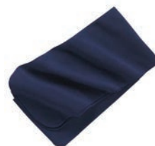
ENT500I-3170 Fleece Scarf