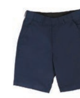
EH600I-21202 Unisex Flat Front Shorts