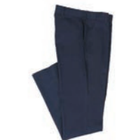
EH600I-21144 Men's Cut Flat Front Work Pant