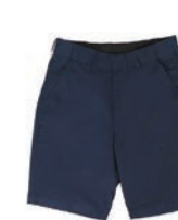
EH6001-21202 Unisex Flat Front Shorts