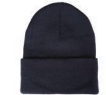
EH900I-21152 Non-branded Knit Cap