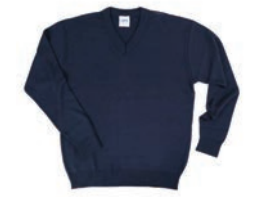
ENT300I-7901 V-Neck Sweater