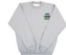
ENH300I-2988 L/S Sweatshirt