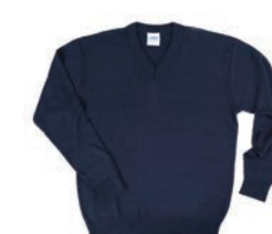
ENT300I-7901 Unisex V-Neck Sweater

National Customer Service Reps are required to wear neckware at the National counter. If a location has a dual or tri-brand counter that includes the National brand, neckwear is required. Neckwear is only optional at the counter if the National brand is not present.