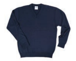
ENT300I-7901 V-Neck Sweater