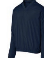
ENT3000I-7874 L/S Windshirt