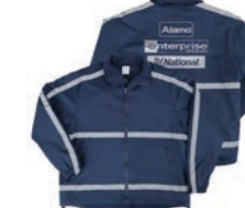
ENT300I-7875 Lt Wt Nylon Jacket