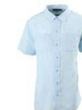
ENT200I-1510 Men's Cut S/S Ripstop Shirt