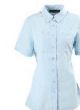
ENT2001-1540 Women's Cut S/S Ripstop Shirt