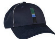
EH900I-20759 Baseball Cap w/ Color Strip