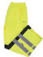
ENT6001-6824 Hi-Viz Rain Pants