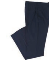
EH600I-21263 Women's Cut Tailored Pant