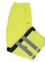
ENT600I-6824 Hi-Viz Rain Pants