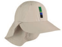
ETS9001-21175 Full Coverage Sun Cap with Shared Logo-Size:OSFA