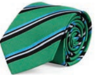
ENG500I-6466 Men's Cut Multibrand Tie