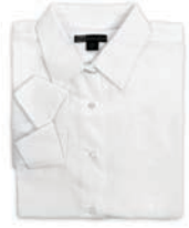
ENT4001-5045 3/4 Sleeve Maternity Blouse