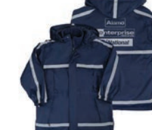
ENT300I-7855 3-in-1 System Parka