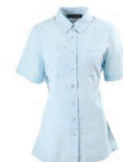
ENT200I-1540 Women's Cut S/S Ripstop Shirt