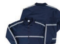
ENT3001-7875 Lt Wt Nylon Jacket