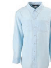
ENT200I-1512 Men's Cut L/S Ripstop Shirt