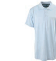
ENH100I-2820 Men's Cut S/S Polo