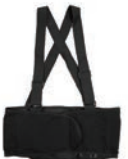
EH500I-21070 Back Support