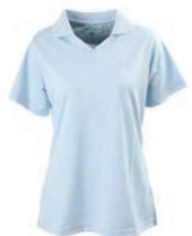
ENT100I-2830 Women's Cut S/S Polo