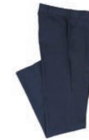
EH600I-21144 Men's Cut Flat Front Work Pant