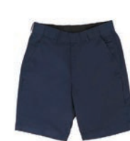
EH600I-21202 Unisex Flat Front Shorts