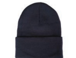
EH9001-21152 Non-branded Knit Cap