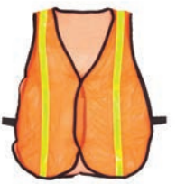
EH8001-21076 Safety Vest no Logo