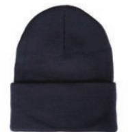
EH900I-21152 Non-branded Knit Cap