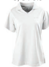
ENT100I-2830 Women's Cut Polo