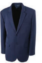
ENT300I-6276 Men's Cut Blazer