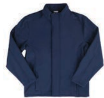
ENT3001-7876 Men's Cut Soft Shell Jacket