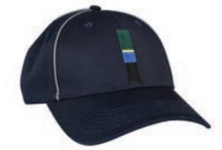
EH9001-20759 Baseball Cap w/ Color Strip