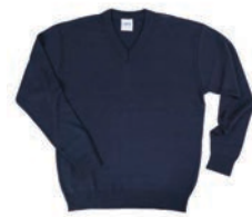
ENT3001-7901 V-Neck Sweater