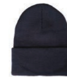
EH9001-21152 Non-branded Knit Cap