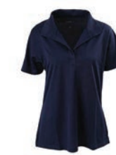
ENT100I-2821 Women's Cut S/S Polo