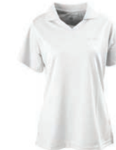
ENT1001-2830 Women's Cut Polo