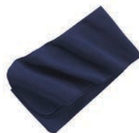
ENT5001-3170 Fleece Scarf