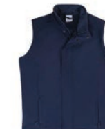
ENT300I-7878 Men's Cut Soft Shell Vest