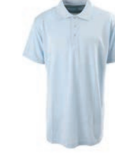
ENH100I-2820 Men's Cut Polo