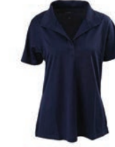
EH1001-20918 Women's Cut Navy Short Sleeve Blank Polo