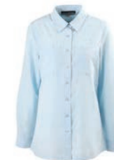
ENT200I-1542 Women's Cut L/S Ripstop Shirt