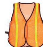
EH800I-21076 Safety Vest no Logo