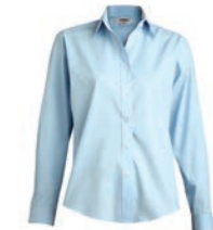
ENT400I-2122 Women's Cut L/S Dress Shirts