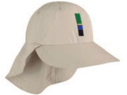
ETS900I-21175 Sun Hat