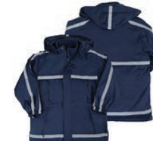
ENT3001-7855 3-in-1 System Parka