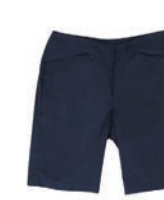
ENT600I-6262 Women's Cut Flat Front Shorts