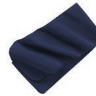
ENT500I-3170 Fleece Scarf