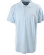
ENH100I-2820 Men's Cut S/S Polo