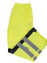
ENT600I-6824 Hi-Viz Rain Pants