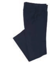
ENT600I-6238 Men's Cut Tailored Pant