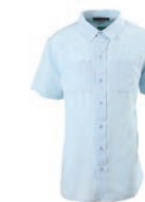
ENT2001-1510 Men's Cut S/S Ripstop Shirt