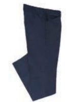
ENT600I-6262 Women's Cut Flat Front Work Pant