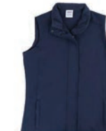
ENT300I-7879 Women's Cut Soft Shell Vest