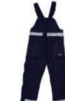
ENT600I-6570 Insulated Suspender Bib Overalls