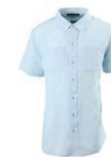
ENT200I-1510 Men's Cut S/S Ripstop Shirt