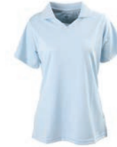
ENT100I-2830 Women's Cut S/S Polo