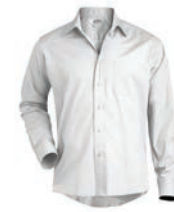
ENT400I-1524/ ENT200I-1542 Men's Cut L/S Poplin Shirt