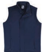
ENT300I-7878 Men's Cut Soft Shell Vest