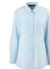
ENT2001-1542 Women's Cut L/S Ripstop Shirt