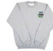
ENH300I-2988 L/S Sweatshirt