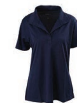
ENT100I-2821 Women's Cut S/S Polo Shirt