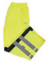
ENT600I-6824 Hi-Viz Rain Pants