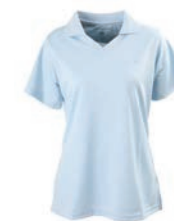
ENT100I-2830 Women's Cut Polo