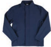
ENT300I-7876 Men's Cut Soft Shell Jacket