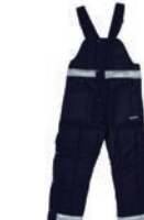
ENT6001-6570 Insulated Suspender Bib Overalls