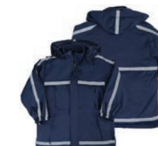
ENT300I-7855 3-in-1 System Parka