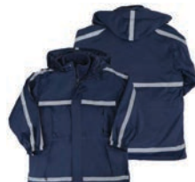
ENT3001-7855 3-in-1 System Parka