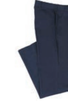
EH600I-21144 Men's Cut Flat Front Work Pant