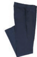
EH600I-21144 Men's Cut Flat Front Work Pant