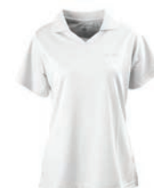
ENT100I-2830 Women's Cut Polo