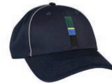
EH900I-20759 Baseball Cap w/ Color Strip