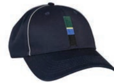
EH9001-20759 Baseball Cap w/ Color Strip