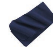
ENT5001-3170 Fleece Scarf