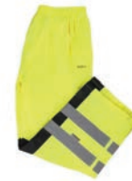
ENT6001-6824 Hi-Viz Rain Pants