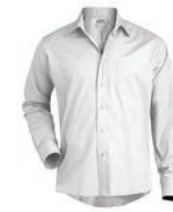
ENT400I-1524 Men's Cut L/S Poplin Shirt