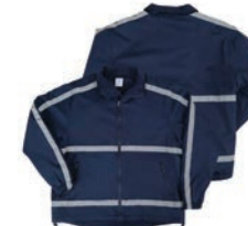
ENT3001-7875 Lt Wt Nylon Jacket