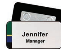
ETS500I-21168 Magnet Back Name Badge