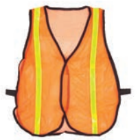
EH800I-21076 Safety Vest no Logo