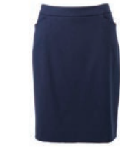
ENT300I-6282 Women's Cut Skirt