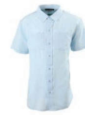
ENT200I-1510 Men's Cut S/S Ripstop Shirt