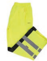
ENT6001-6824 Hi-Viz Rain Pants