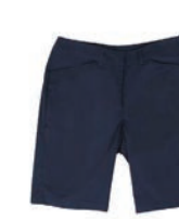
ENT6001-6262 Women's Cut Flat Front Shorts