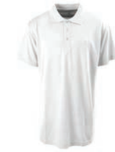
ENT100I-2820 Men's Cut Polo