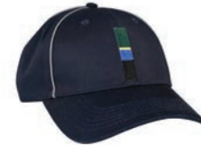
EH9001-20759 Baseball Cap w/ Color Strip