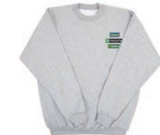
ENH3001-2988 L/S Sweatshirt