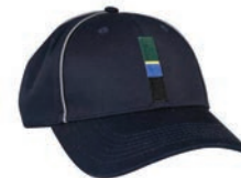
EH900I-20759 Baseball Cap w/ Color Strip