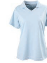
ENT100I-2830 Women's Cut Polo