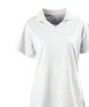
ENT100I-2830 Women's Cut Polo