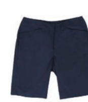
ENT600I-6262 Women's Cut Flat Front Shorts