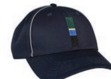
EH900I-20759 Baseball Cap w/ Color Strip