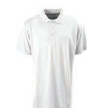
ENT100I-2820 Men's Cut Polo