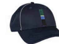
EH900I-20759 Baseball Cap w/ Reflective Stripe