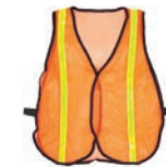
EH8001-21076 Safety Vest no Logo