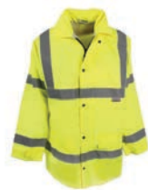
ENT300I-6822 Hi-Viz Rain Jacket