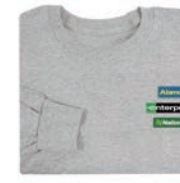
EH17001-1003 L/S T-Shirt Multibrand