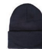
EH9001-21152 Non-branded Knit Cap