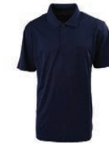
ENT1001-2821 Men's Cut S/S Polo Shirt