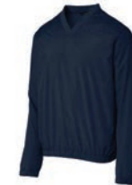
ENT3000I-7874 L/S Windshirt