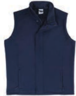
ENT3001-7878 Men's Cut Soft Shell Vest