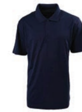
ENT1001-2821 Men's Cut Navy Short Sleeve Blank Polo