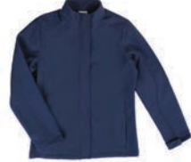
ENT300I-7877 Women's Cut Soft Shell Jacket