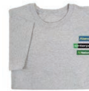
EH1700I-1005 Tribrand S/S T-Shirt MultiBrand