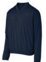
ENT3000I-7874 L/S Windshirt