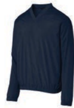
ENT30001-7874 L/S Windshirt