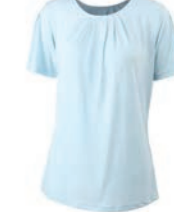
ENT400I-1284 Women's Cut Scoop-Neck Blouse