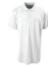
ENT100I-2820 Men's Cut Polo