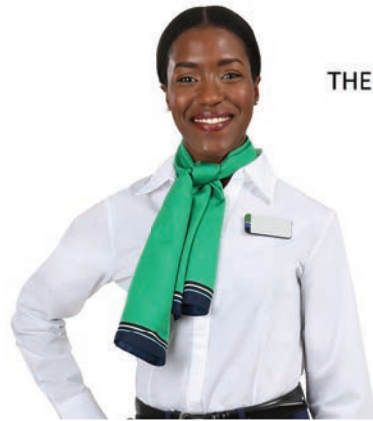
THE CLASSIC KNOT