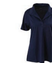
ENT100I-2821 Women's Cut S/S Polo