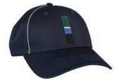
EH900I-20759 Baseball Cap w/ Color Strip