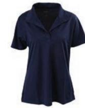
ENT100I-2821 Women's Cut S/S Polo