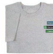
EH17001-1004 S/S T-Shirt MultiBrand