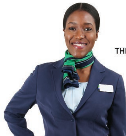
THE HITCH KNOT