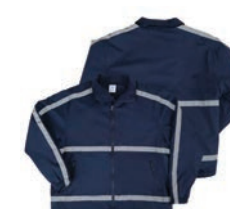
ENT300I-7875 Lt Wt Nylon Jacket