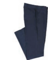
EH6001-21144 Men's Cut Flat Front Work Pant