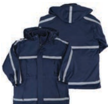
ENT300I-7855 3-in-1 System Parka