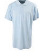
ENH100I-2820 Men's Cut Polo