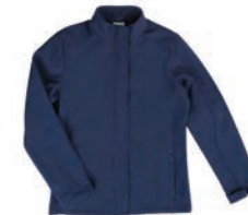
ENT300I-7877 Women's Cut Soft Shell Jacket