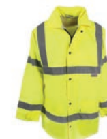
ENT300I-6822 Hi-Viz Rain Jacket