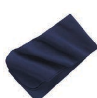
ENT500I-3170 Fleece Scarf