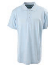
ENH100I-2820 Men's Cut Polo