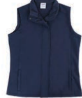
ENT3001-7879 Women's Cut Soft Shell Vest