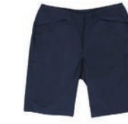
ENT600I-6262 Women's Cut Flat Front Shorts