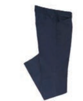
ENT6001-6262 Women's Cut Flat Front Work Pant