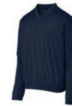
ENT3001-7874 L/S Windshirt