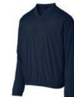
ENT30001-7874 L/S Windshirt