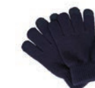
ENT5001-3190 iPad Gloves