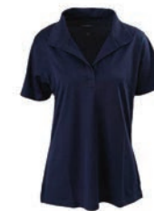
ENT100I-2821 Women's Cut S/S Polo Shirt