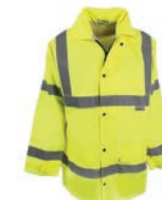
ENT3001-6822 Hi-Viz Rain Jacket