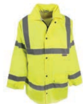
ENT3001-6822 Hi-Viz Rain Jacket