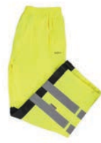
ENT600I-6824 Hi-Viz Rain Pants