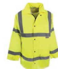
ENT300I-6822 Hi-Viz Rain Jacket