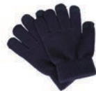
ENT5001-3190 iPad Gloves