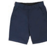
EH6001-21202 Unisex Flat Front Shorts