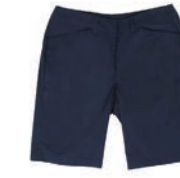
ENT6001-6262 Women's Cut Flat Front Shorts