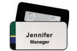
ETS500I-21168 Magnet Back Name Badge