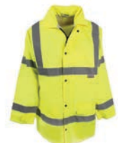
ENT300I-6822 Hi-Viz Rain Jacket