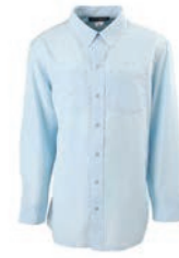
ENT200I-1512 Men's Cut L/S Ripstop Shirt