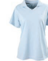
ENT1001-2830 Women's Cut Light Blue Polo