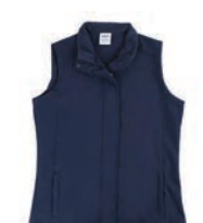
ENT300I-7879 Women's Cut Soft Shell Vest