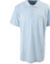
ENT1001-2820 Men's Cut Light Blue Polo