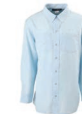
ENT2001-1512 Men's Cut L/S Ripstop Shirt