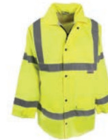
ENT3001-6822 Hi-Viz Rain Jacket