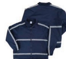
ENT300I-7875 Lt Wt Nylon Jacket