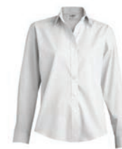
ENT400I-1544 Women's Cut L/S Poplin Shirt