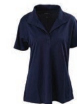
ENT1001-2821 Women's Cut S/S Polo Shirt