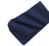
ENT500I-3170 Fleece Scarf