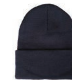
EH900I-21152 Non-branded Knit Cap