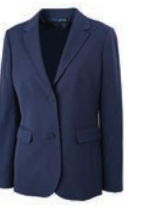
ENT300I-6282 Women's Cut Blazer