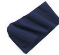
ENT5001-3170 Fleece Scarf