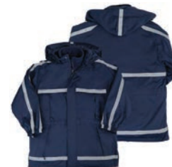
ENT300I-7855 3-in-1 System Parka