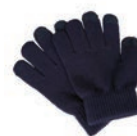
ENT500I-3190 iPad Gloves