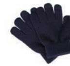
ENT5001-3190 iPad Gloves