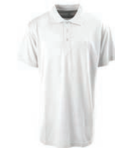
ENT100I-2820 Men's Cut Polo