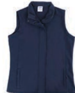
ENT300I-7879 Women's Cut Soft Shell Vest