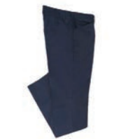
ENT600I-6262 Women's Cut Flat Front Work Pant