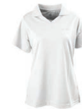
ENT100I-2830 Women's Cut Polo