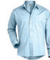
ENT400I-2124 Men's Cut L/S Dress Shirts