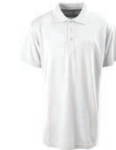
ENT1001-2820 Men's Cut Polo