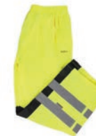
ENT600I-6824 Hi-Viz Rain Pants